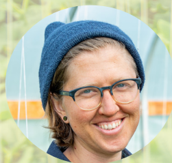
LILY - Vegetable Farmer

"I love knowing that by shopping here, I'm helping local farming businesses and increasing the variety of foods I eat!"