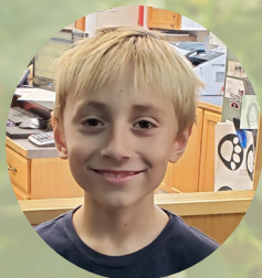
EASTON - 3rd Grader

"The IDA program helped me buy a delivery van so our farm can expand our delivery area for our customers."