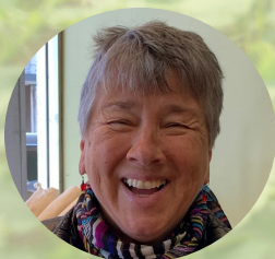
TAM - FarmTable Customer

"I love knowing that by shopping here, I'm helping local farming businesses and increasing the variety of foods I eat!"