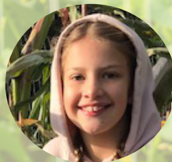
GIGI - 4th Grader

"The best field trip was going to Fish People [at Port of Garibaldi] because they showed us different types of fish."